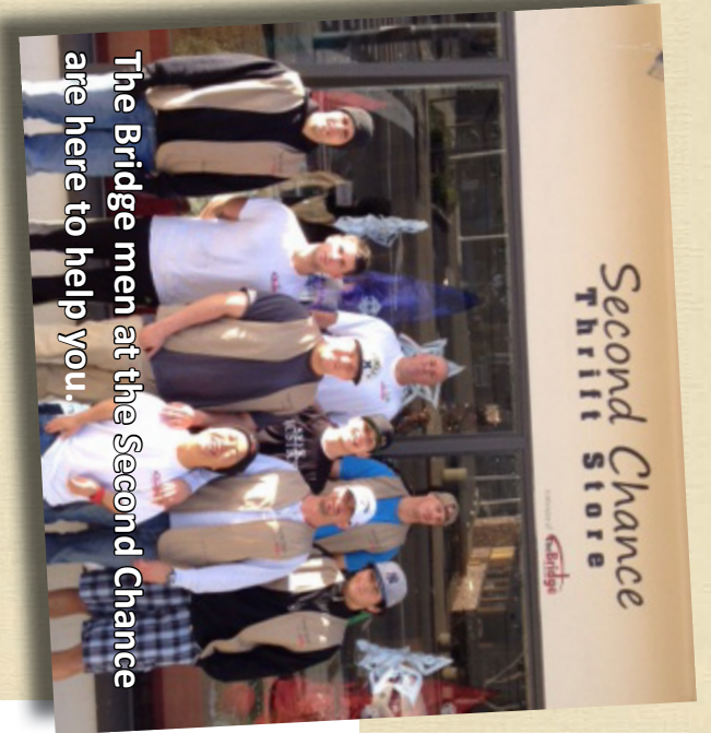
The Bridge men at the Second Chance are here to help you.

B2B Bike Ride - "Ride to Restore" b2bRide@gmail.com (831) 204-8789