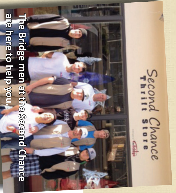
The Bridge men at the Second Chance are here to help you.

B2B Bike Ride - "Ride to Restore" b2bRide@gmail.com (831) 204-8789