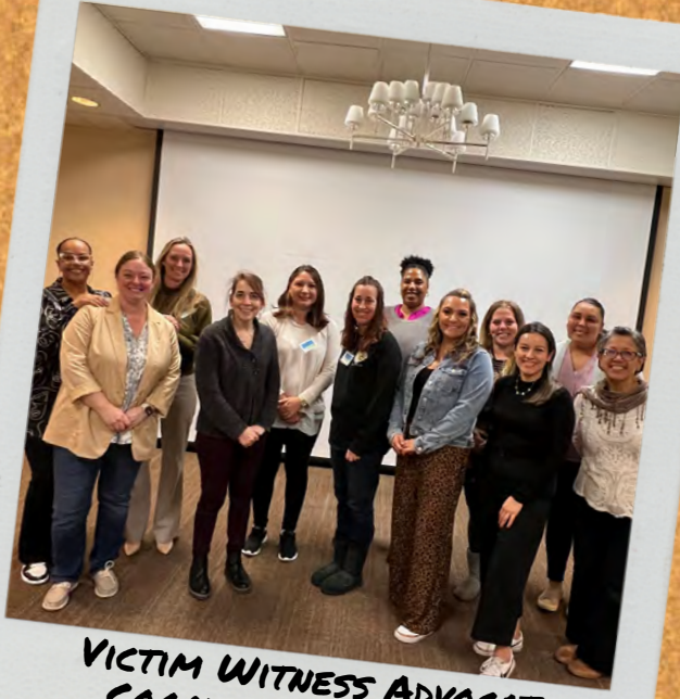
VICTIM WITNESS ADVOCATE COORDINATOR ACADEMY 12/7/2023