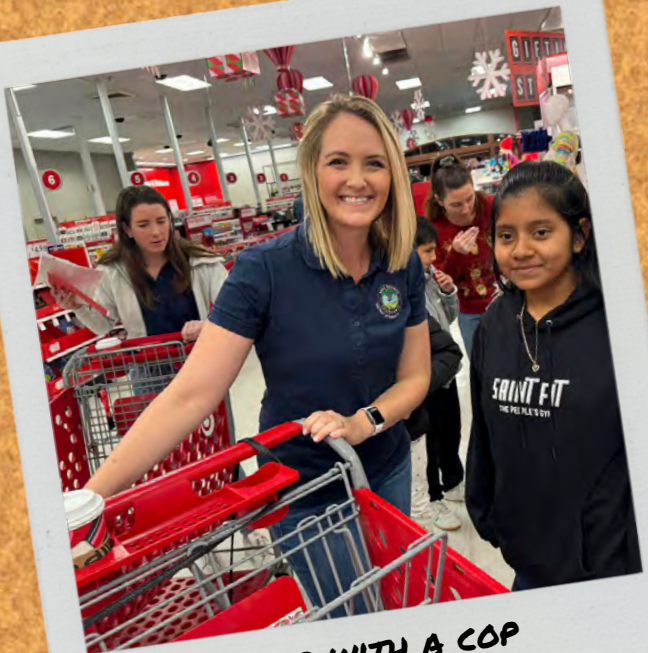
SHOP WITH A COP 12/09/2023